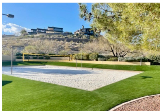
Replaced with artificial turf