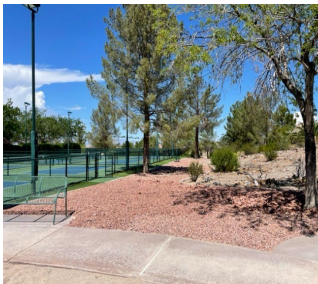
New Pickleball Courts

ACC has recently signed an agreement to remove additional turf at our Fitness Center complex and replace with a similar look to the front entrance of the main clubhouse. This work will begin next month and will be completed by mid-November at a cost of $146,000.