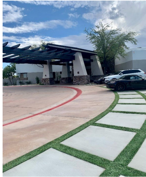
Front Entrance Circle – artificial turf

In March, 2022, we removed over 11,000 sq ft of turf at our pool complex and replaced it with artificial turf at a cost to the Club of over $65,000 net after the WET incentive.