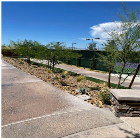
Tennis Court Complex

From the pool, we moved to the Court Complex and Playground area where we were able to remove over 14,000 sq. ft. of turf combined throughout that area while still maintaining a landscape pallet attractive for the Club yet functional and in compliance.