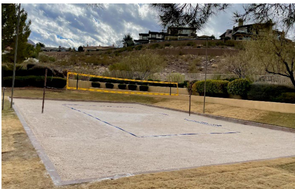
Volleyball Court in Pool Complex

In March, 2022, we removed over 11,000 sq ft of turf at our pool complex and replaced it with artificial turf at a cost to the Club of over $65,000 net after the WET incentive.