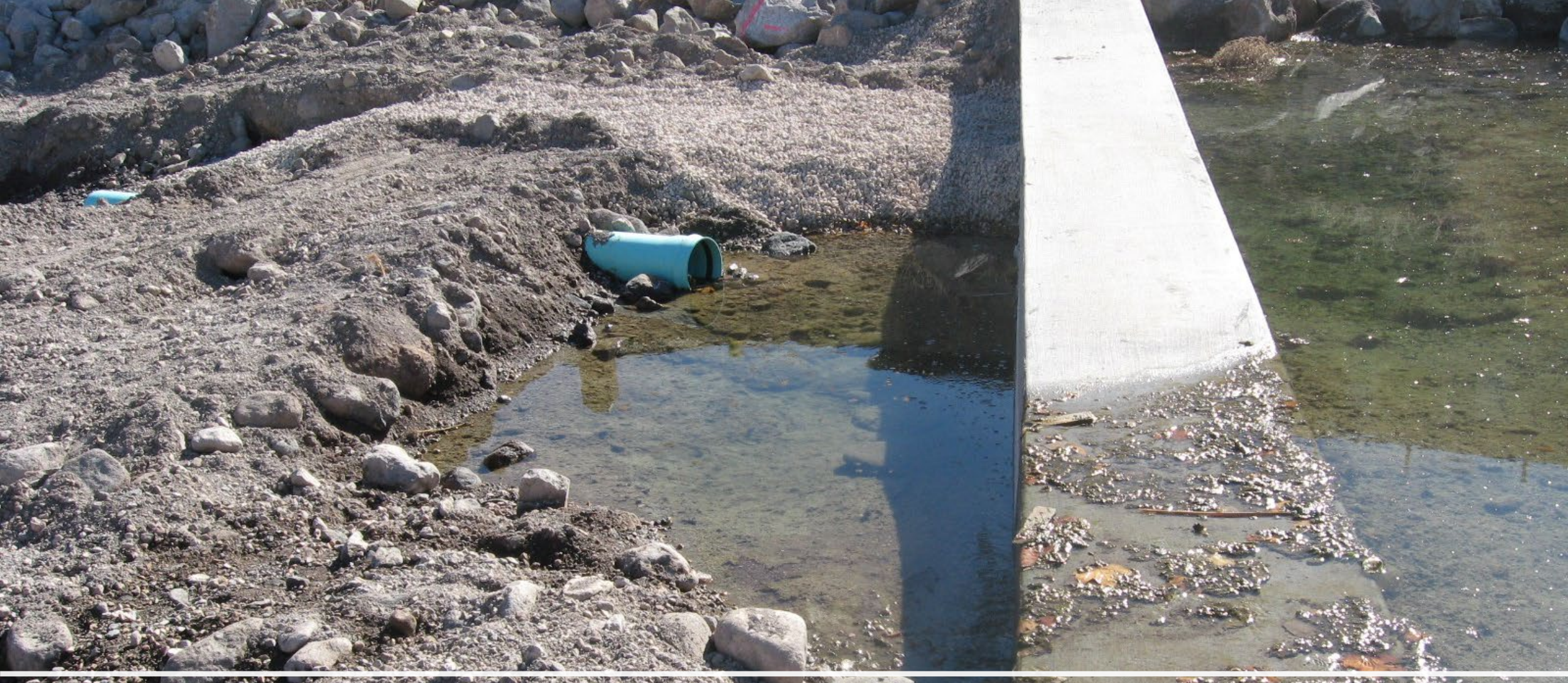
Valle Verde to UPRR Trestle (2012)