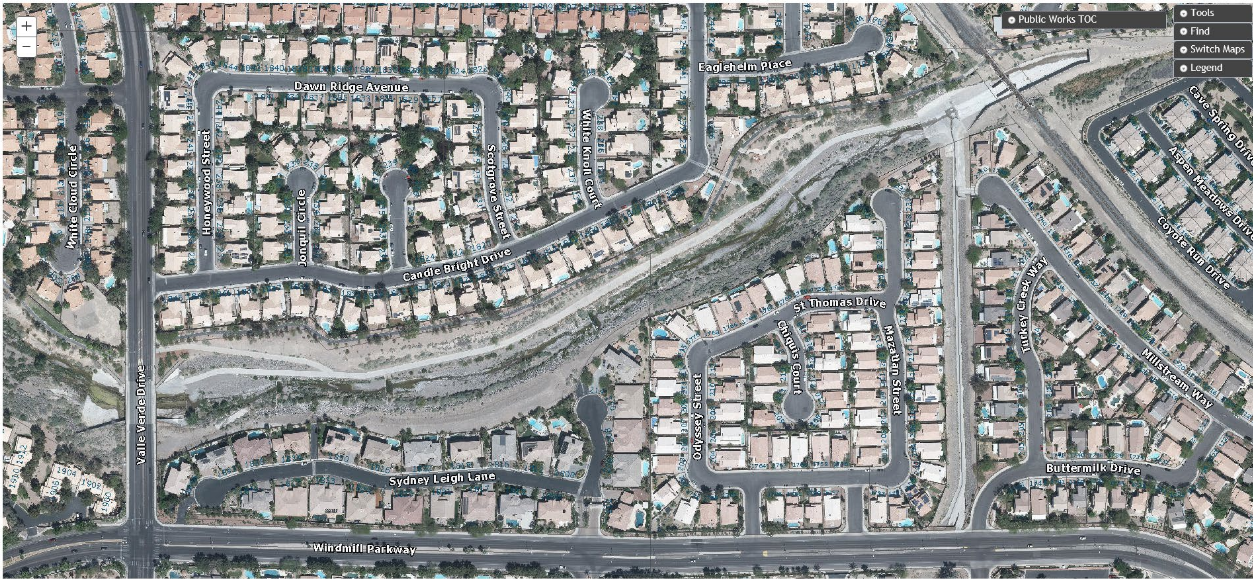
Valle Verde to UPRR Trestle