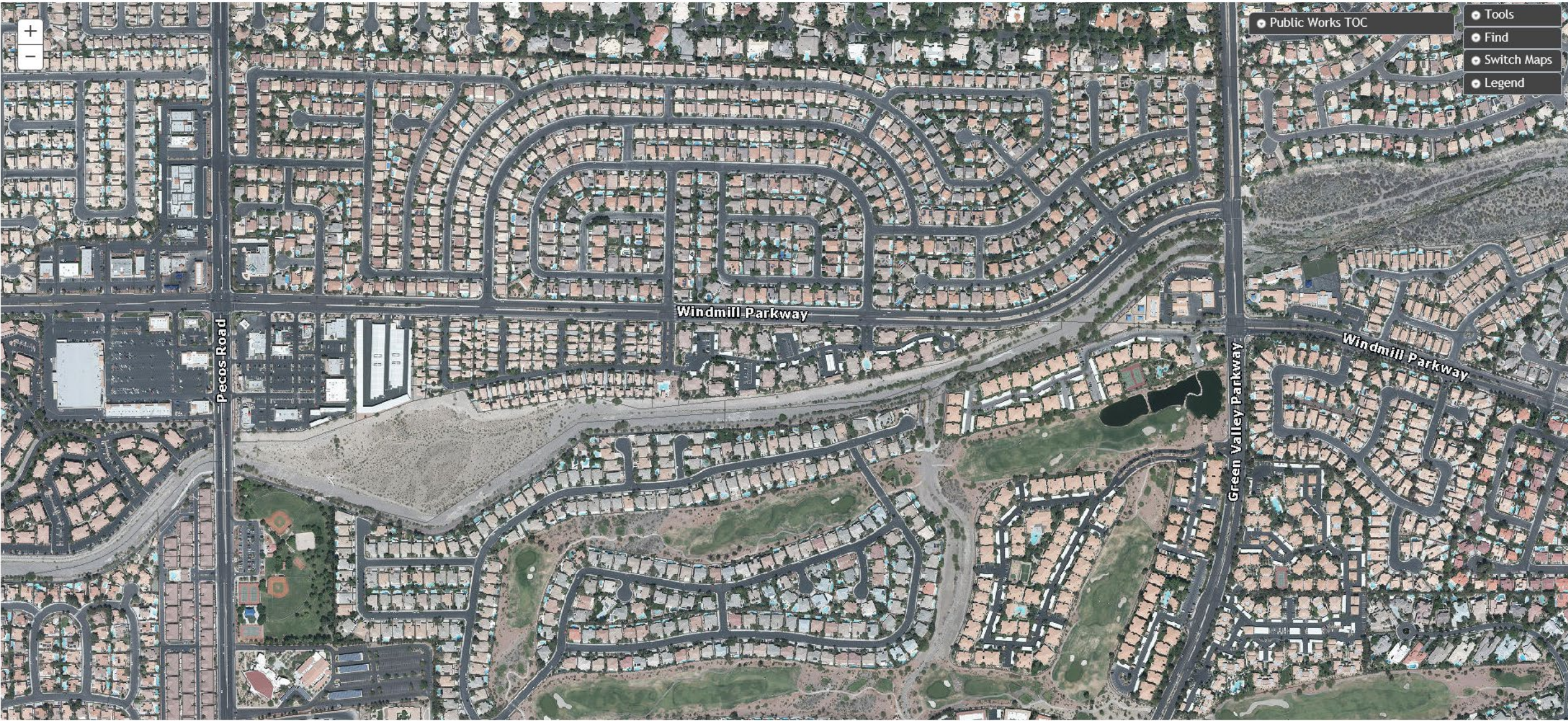
Pecos to Green Valley Parkway