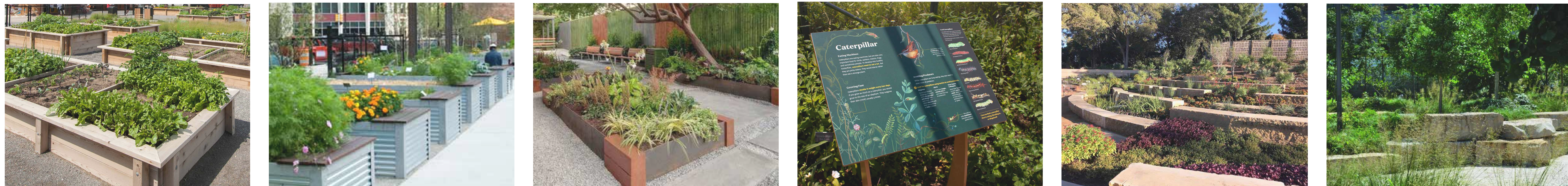
Community Garden & Outdoor Classroom