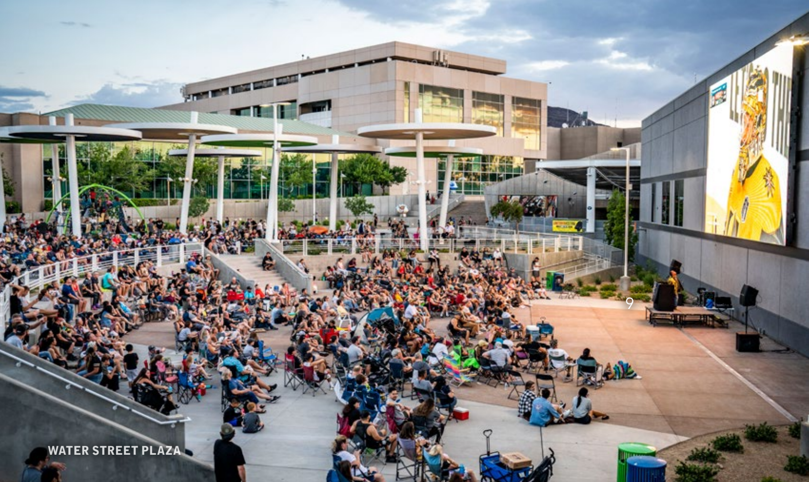
WATER STREET PLAZA