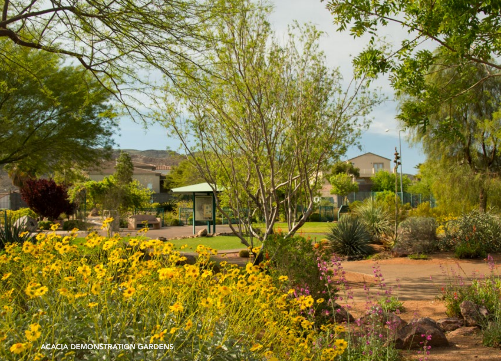
ACACIA DEMONSTRATION GARDENS